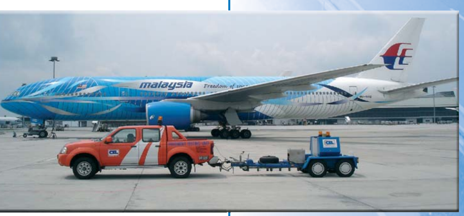
HEAVY WEIGHT DEFLECTOMETER

anticipated load/deflection measurements on even heavy pavements such as airfields and very thick highway pavements. The wider loading range also provides the consultant with a load/ deflection instrument appropriate for both roads and airfields as required.