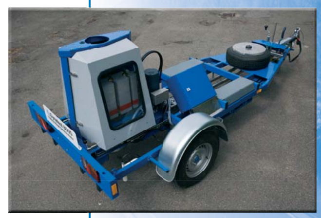
FALLING WEIGHT DEFLECTOMETER

The use of a Dynatest FWD enables the engineer to determine a deflection basin caused by a controlled load with accuracy and resolution superior to other existing test methods. The FWD produces a dynamic impulse load that simulates a moving wheel load, rather than a static, semi-static or vibratory load. These developments allow the use of mechanistic approaches to analyse FWD data.